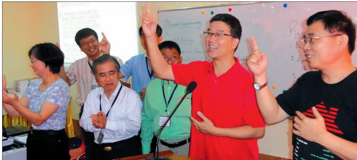
Worshippers sing during the Mennonite World Conference Asia Caucus training sessions in Kolkata, India. "When we tired of sitting, we sang!" one participant said. They sang "Jesus Loves Me" in every language spoken by people in the room.